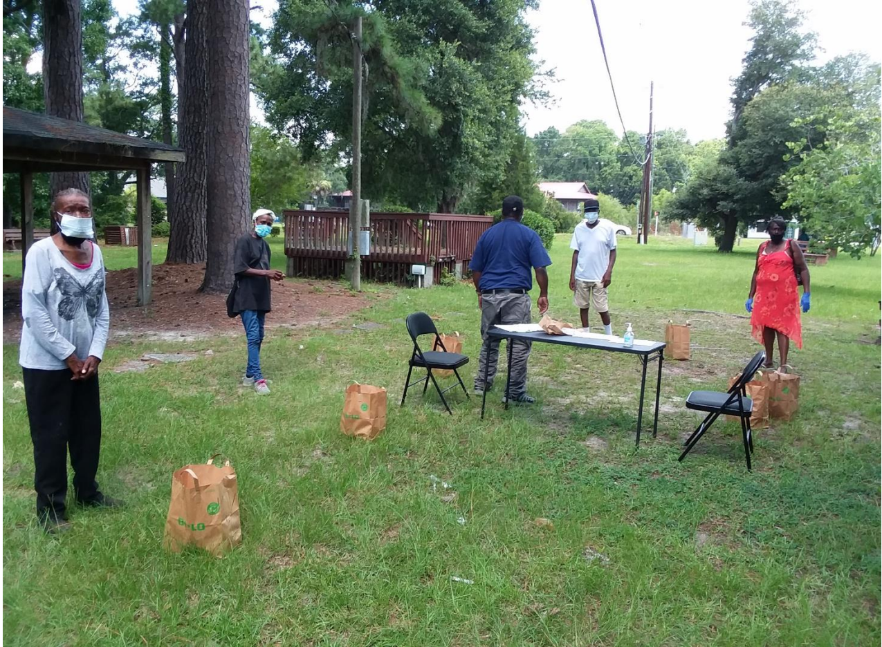
Food , Toiletries & PPE's Distribution at MLK Park on Saint Helena Island, SC