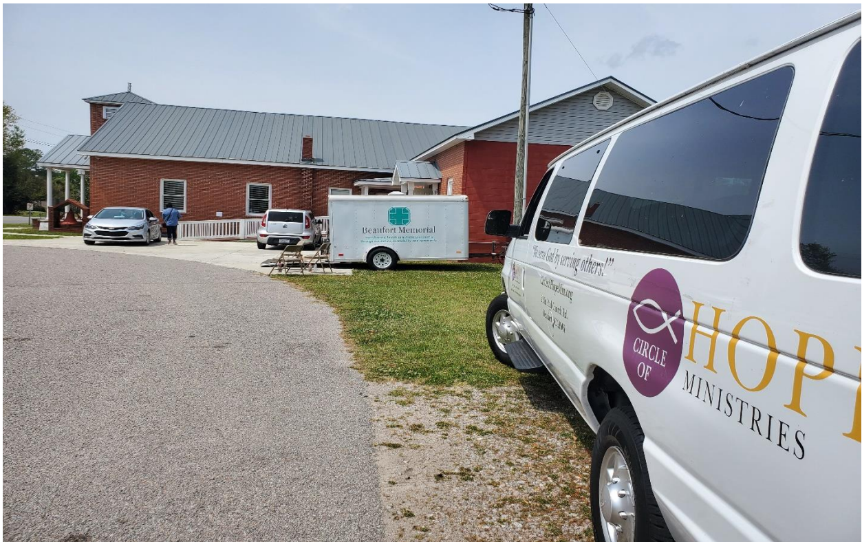
The Circle of Hope Ministries Transported our Homeless Brothers & Sisters to Mount Carmel Baptist Church for Covid 19 Vaccinations Administered by Beaufort Memorial Hospital Mobile Medical Team