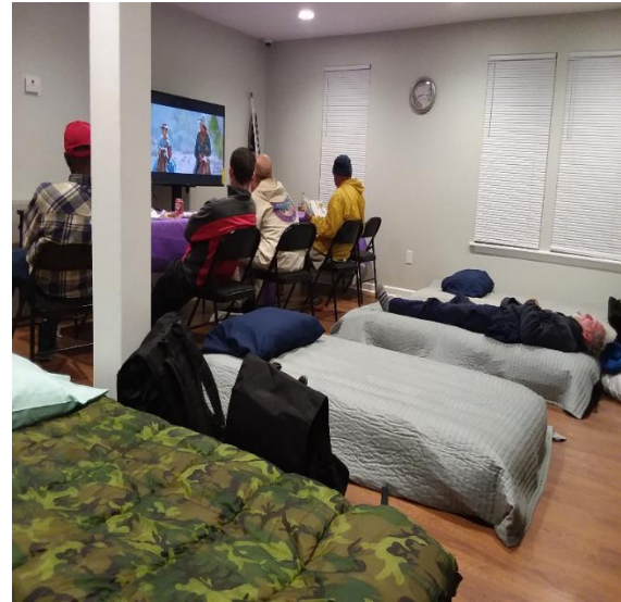
Multipurpose Room for Emergency Shelter