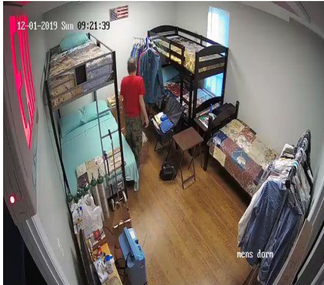
Circle of Hope's Hospitality House: Men's Dormitory