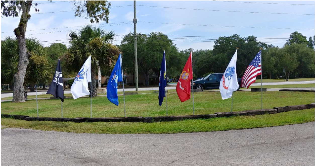
Flag Display at the Veterans 1 st Thrift Store, 612 Robert Smalls Pkwy (Hwy. 170) Beaufort, SC